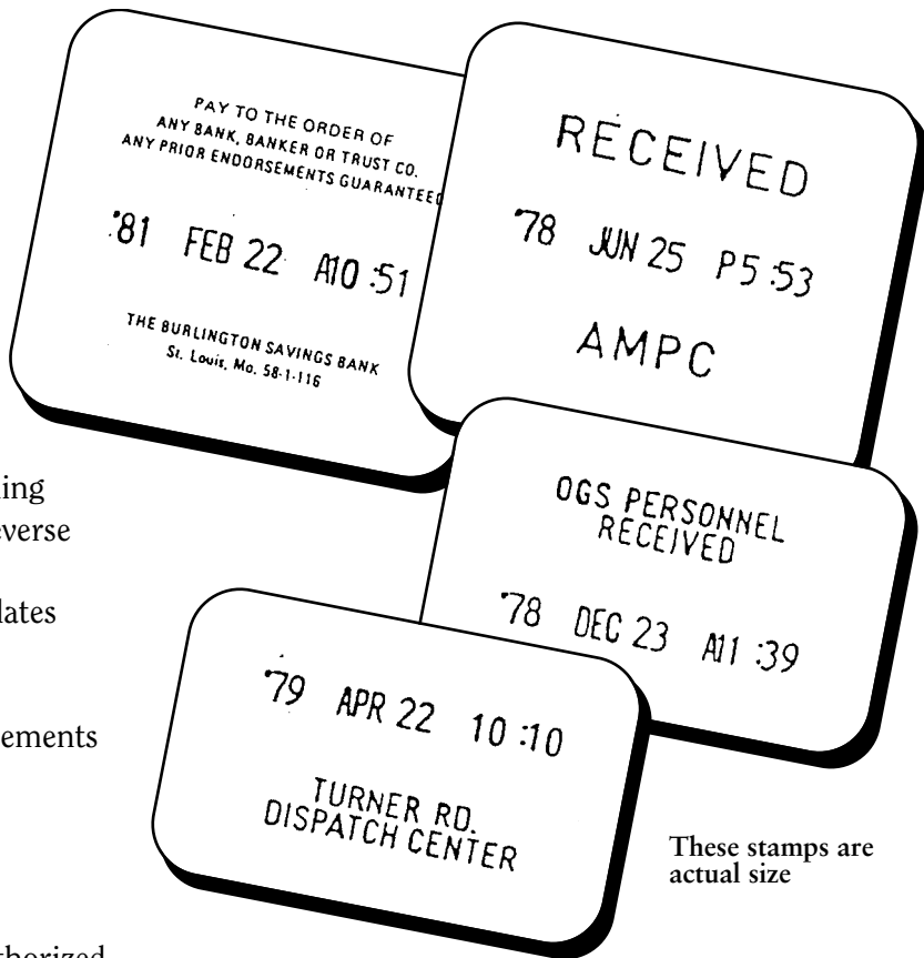
These stamps are actual size